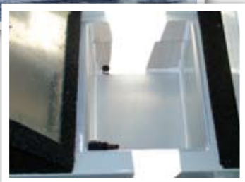
All alloy bait tank (not plastic)