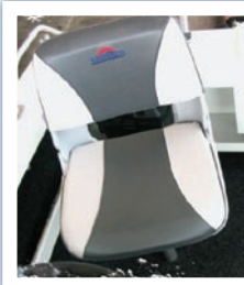
Paded fold down seat