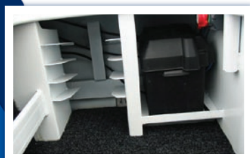
Optional "Built in" Tackle storage