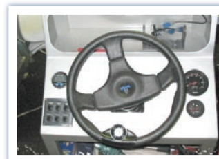
Standard single console