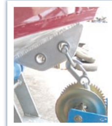
Stainless Steel sheathed winch cleat