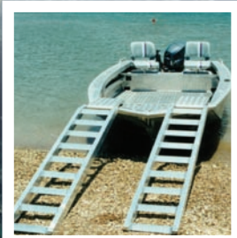
AR450T - with Quad loading ramps